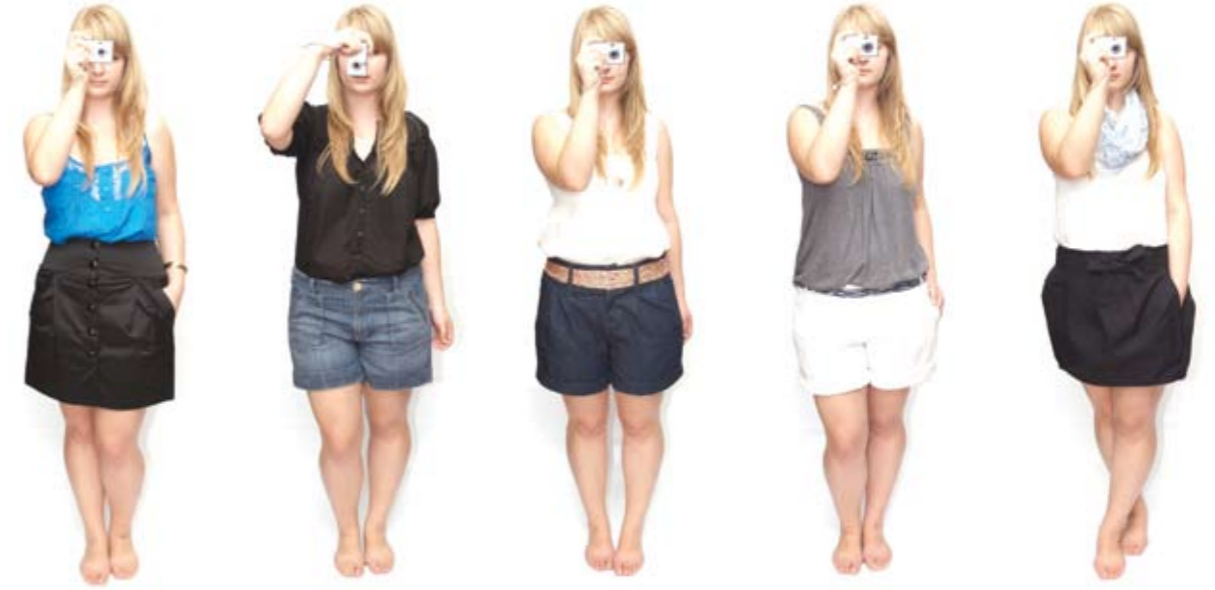
Above: My Style Diary Trial - Five days of documenting my daily apparel.

kudos to other style bloggers they respect. Style bloggers have even started to gain respect from the big wigs in the industry as credible fashion influencers being written about in French Vogue and US Harper's Bazaar. This fall a handful of fashion bloggers were also invited to attend many of the main shows at Paris fashion week – a special invitation normally only reserved for magazine editors. So how does one gain this kind of credibility in the fashion world? The style bloggers currently getting snaps for their dress sense did not start out to become famous – they simply started to document their daily outfits. Regular readers on Vogue Forums Australia ( forums.vogue.com.au ) comment daily