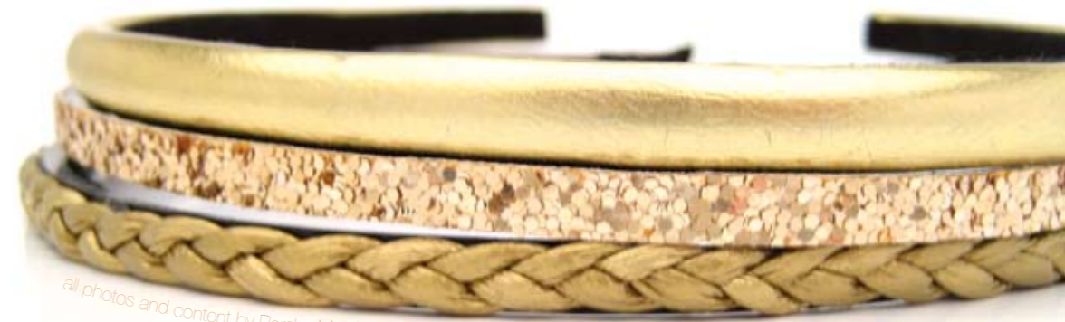
all photos and content by Porsha Marais